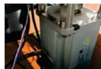
Panasonic AC Servo Motor