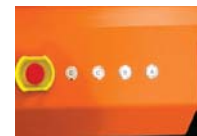
Individual Vacuum Areas