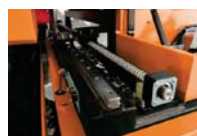
Double Screw Rod