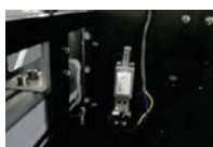
Auto Detect Material Thickness