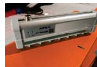
Anti Static System